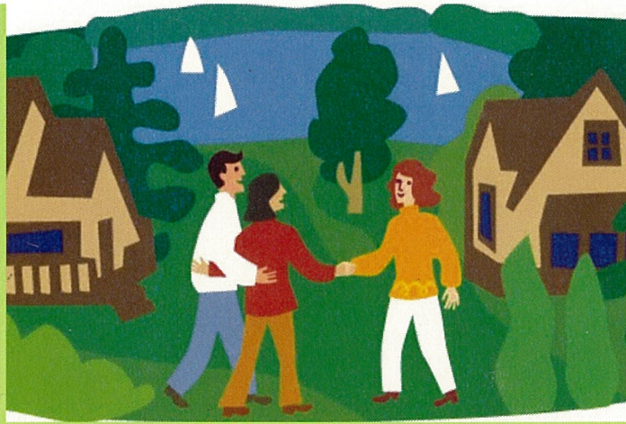
Ghaa-dvn sda Neighbors